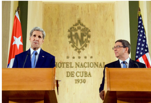
Secretary of State John Kerry and Cuban Foreign Minister Bruno Rodríguez address reporters during a joint news conference at the Hotel Nacional in Havana, Cuba, on August 14, 2015.

This PDAA luncheon program will be held from 12 noon to 2 p.m. on Monday, November 16 at DACOR-Bacon House, 1801 F Street NW, in Washington, D.C. Reservations are $35 for members and $42 for non-members. The deadline for reservations is Tuesday, November 10. You can reserve with a credit card at www.publicdiplomacy.org or complete and mail the form on page 7 with your check.